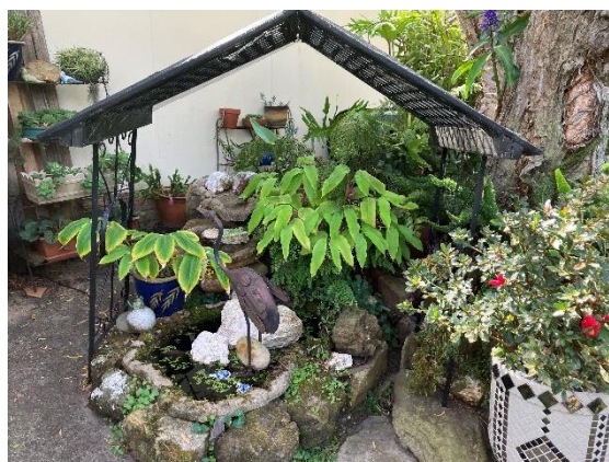
The tadpole pond