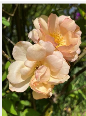
Crepuscle and Pierre de Ronsard roses