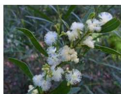
MYRTLE WATTLE Acacia myrtifolia July-October