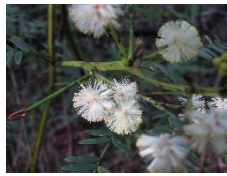
SUNSHINE WATTLE Acacia terminalis April - Sept