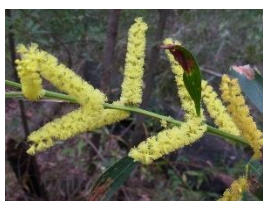
SYDNEY GOLDEN WATTLE Acacia longifolia July - Sept