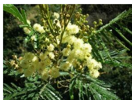
BLACK WATTLE Acacia mearnsii January