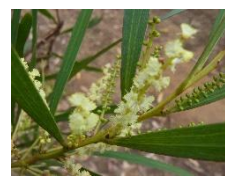
BLUNT LEAF WATTLE Acacia obtusifolia Dec - Jan