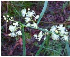
SWEET SCENTED WATTLE Acacia suaveolens March - August