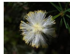
PRICKLY MOSES Acacia ulicifolia April - July