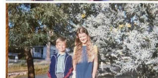
Before and after