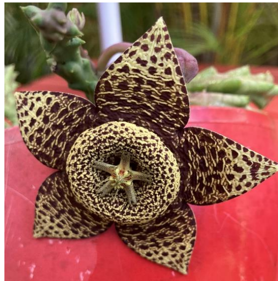
Clockwise from bottom left: Staples hirsuta – Hairy Starfish plant Lipstick plant Orchard Swallowtail butterfly Salvia & Magnolia Orbea variegata – Star flower