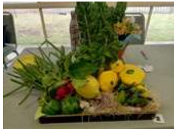
2 nd Debbie Kendall