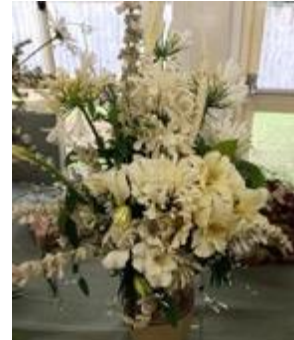
3 rd : Yvonne Steain