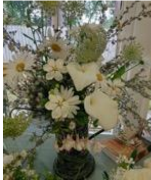
2 nd Sheila Gallant