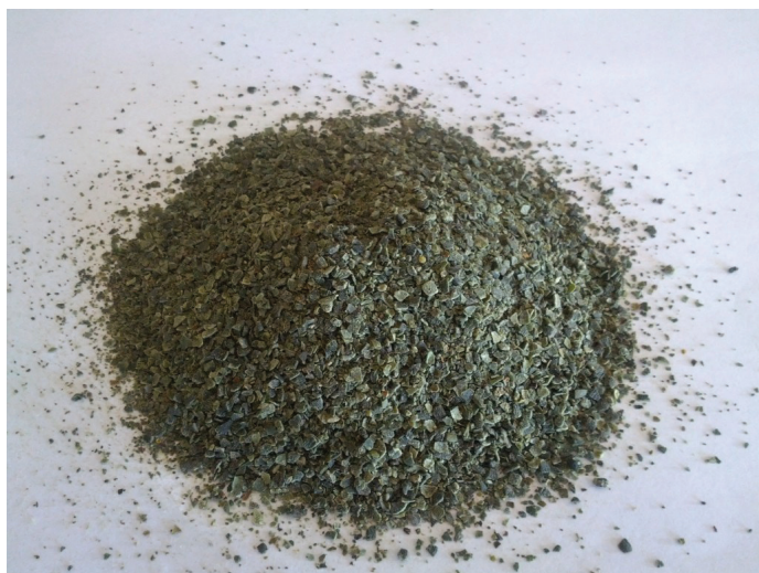
Granulated kelp fertilizer.

Some gardeners believe that proper stewardship of the soil eliminates the need for applying even the organic version of these NPK fertilizers. However, in a community garden setting, we want to make sure that new gardeners enjoy a successful yield in their first year, while adding organic materials can take several years to repopulate a healthy soil ecosystem. The principle of organic gardening is to feed life in the soil rather than just the plants growing in it. When there is a need for fertilizers in a community garden plot, educating your gardeners about the most integrated fertilizing methods will benefit life in the soil for years to come.